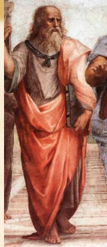
Plato (428? – 547 BC)

If our bodies are operating at light speed on the inside, at our most fundamental level of existence, why don't we feel it on the outside, where we spend our days living at the painfully slow pace of ordinary mortal beings? Why is there a gap between these two worlds?