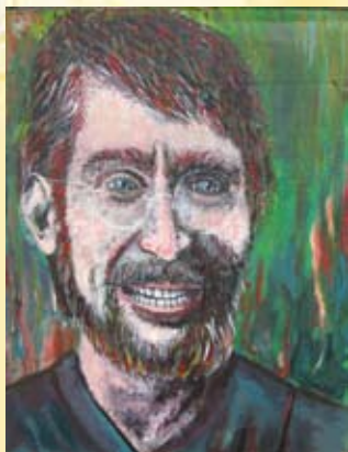
"Hope," a self-portrait painted in January 1990, the fourth month of my convalescence period

them to put me back on the schedule at work?" I urged.