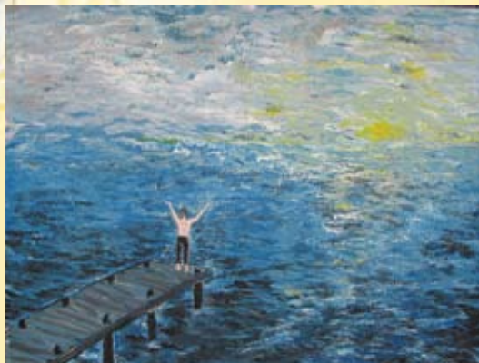
"Breath of Fire," Lake Washington, 1990